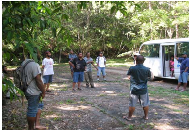
Field Trip Up to Varirata National Park