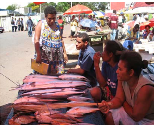
Field Survey – Manu Fish Market