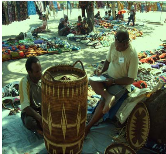
Biodiversity Survey at Boroko Crafts Market