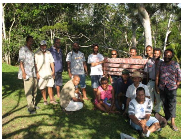
Group photo at the Varirata National Park