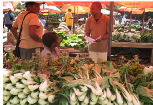
Market Good Servay, Manu Market