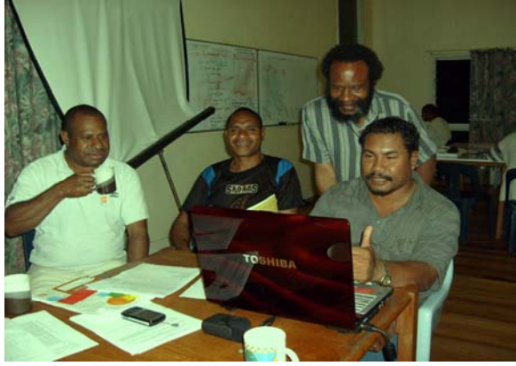
Group Compiling Field Report