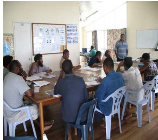
Lecture in Progress