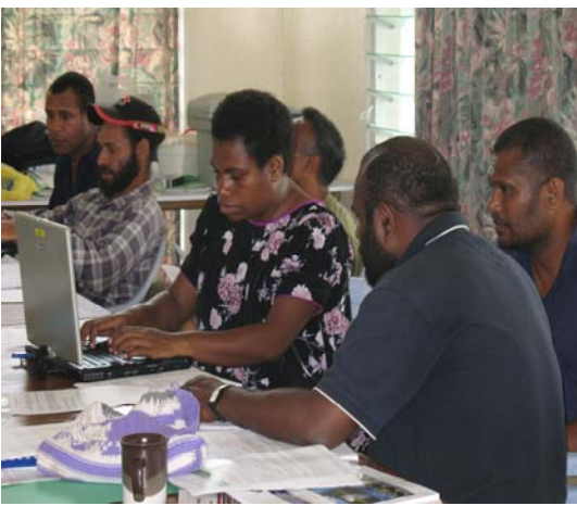
Group compiling Field Report