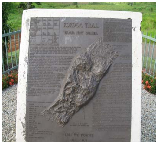
The Monument of Marking the Famous Beginning of the Famous Kokoda Track