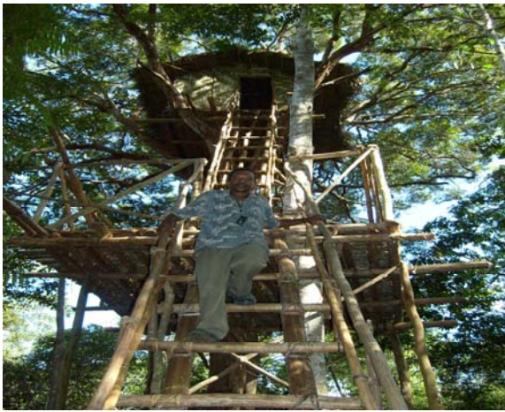
The Koiere Tree House, Vararita NP