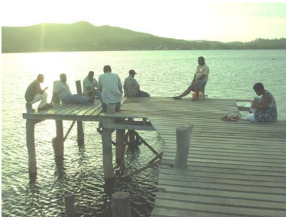
Waiting for Boat @ Tahira, Bootless Bay