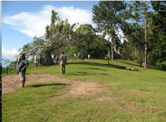
Varirata NP lookout Point, MIRC Back ground