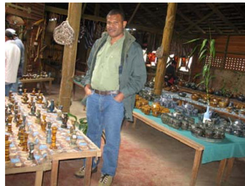
Work of Art