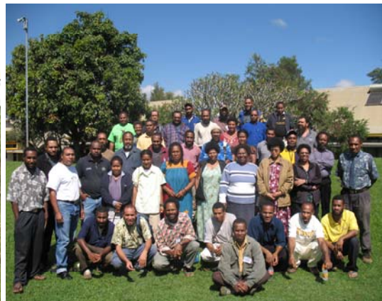
Participants Group Photo