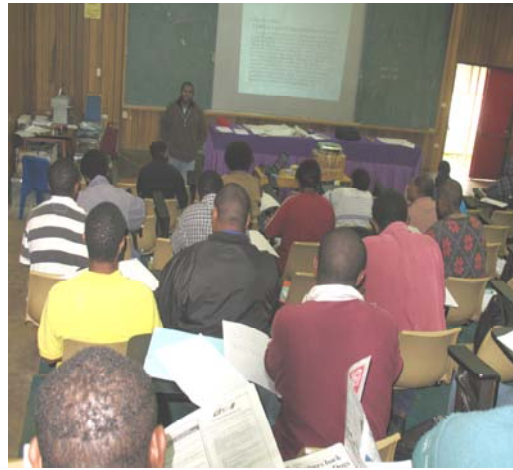
Lecture in Progress