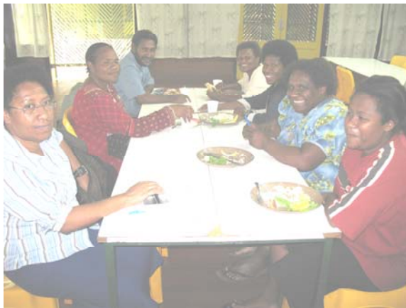
Lunch ...Yes!! Gender Balance@ NSI