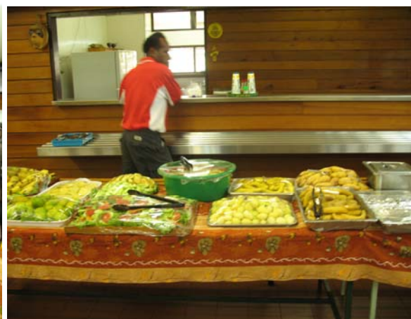
Yes! Something to eat at the end of the week long training