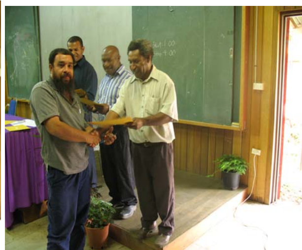
Participants Graduating with Certificate