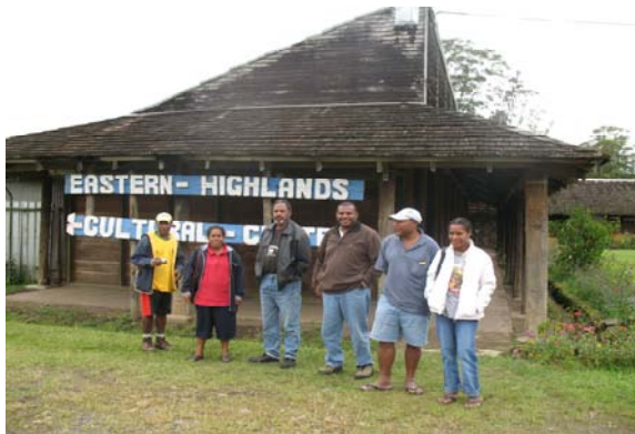
A visit to the Eastern Highland Cultural Center