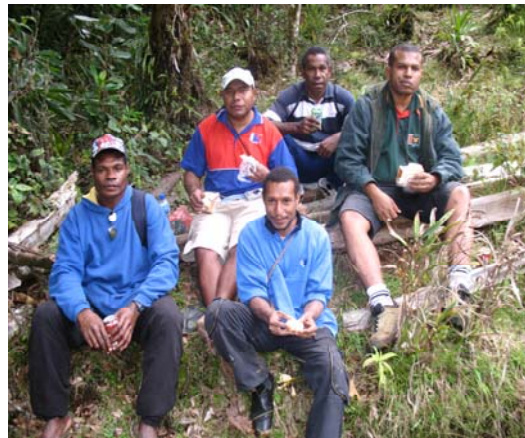
Lunch during Field Trip