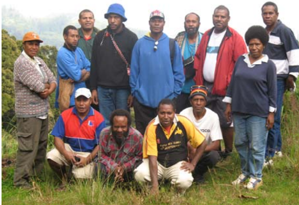
Field Trip up to Mt. Gavesuka Provincial Park