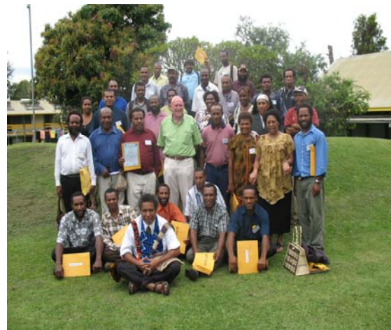
Landowner with Family & Clans man to witness their participant graduate (left). Group photo of trainees