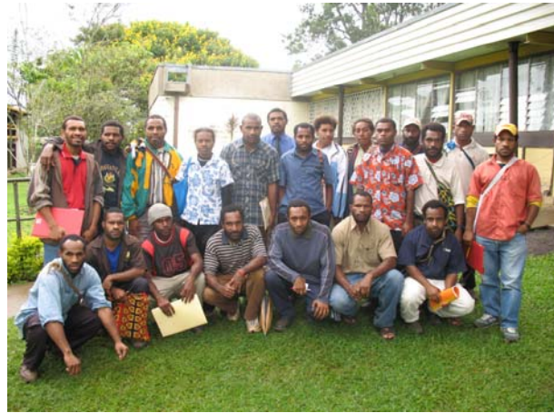
Student Participants from University of Goroka