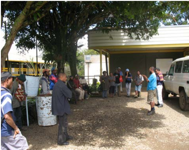
Briefing by Tour Guide before Field Trip