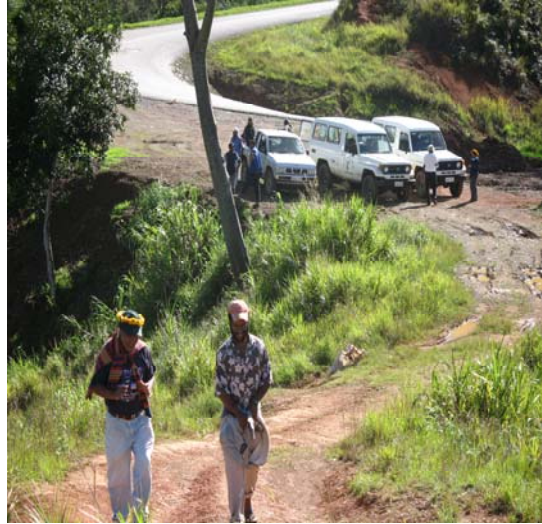
Field trip photo