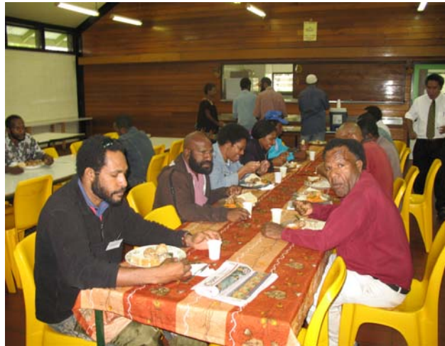
Lunch @ the NSI Mass