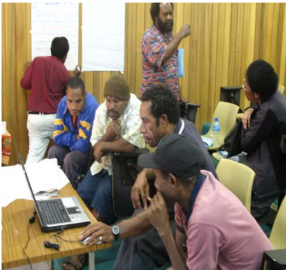
Group Discussions & Presentation