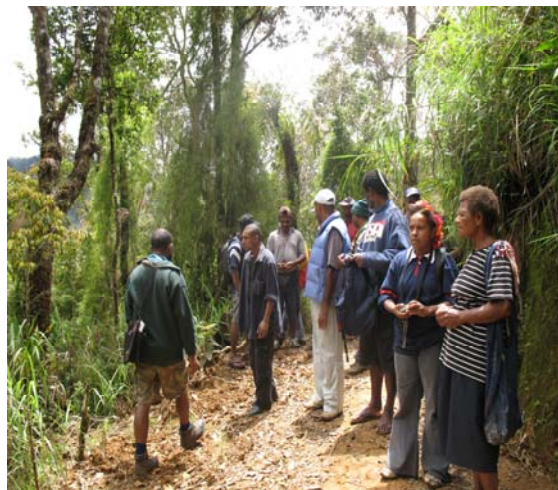
Daulo Walking Track