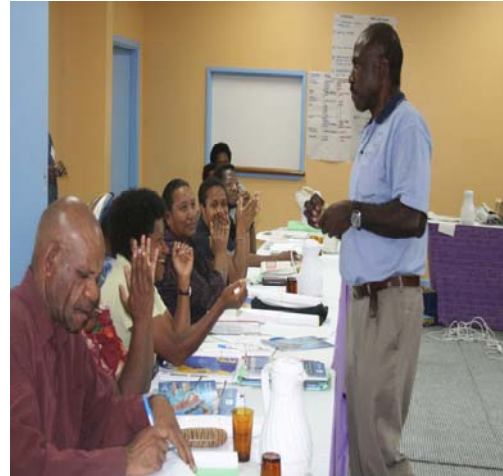
Reward for best proposal writers