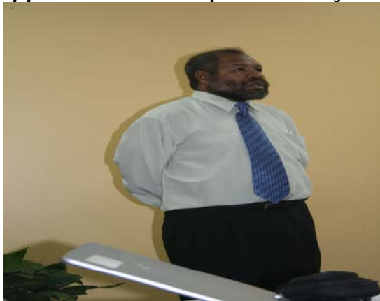
The Governor of NCD Honorable Powes Parkop giving is Key note speech