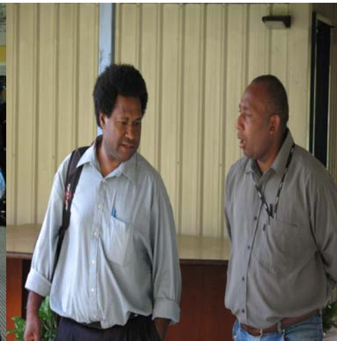
Some of the Participants relaxing after the workshop

Note: Well over hundred photos for the workshop are available. Please write to the Project officer for your copies