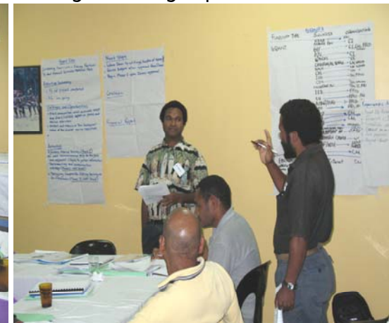
Group Discussions and Presentation